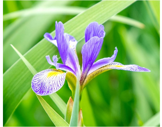
Blue Flag Iris:

You can learn more about where to find native plant seeds and nurseries from Cornell Cooperative Extension or the Habitat Gardeners of CNY.